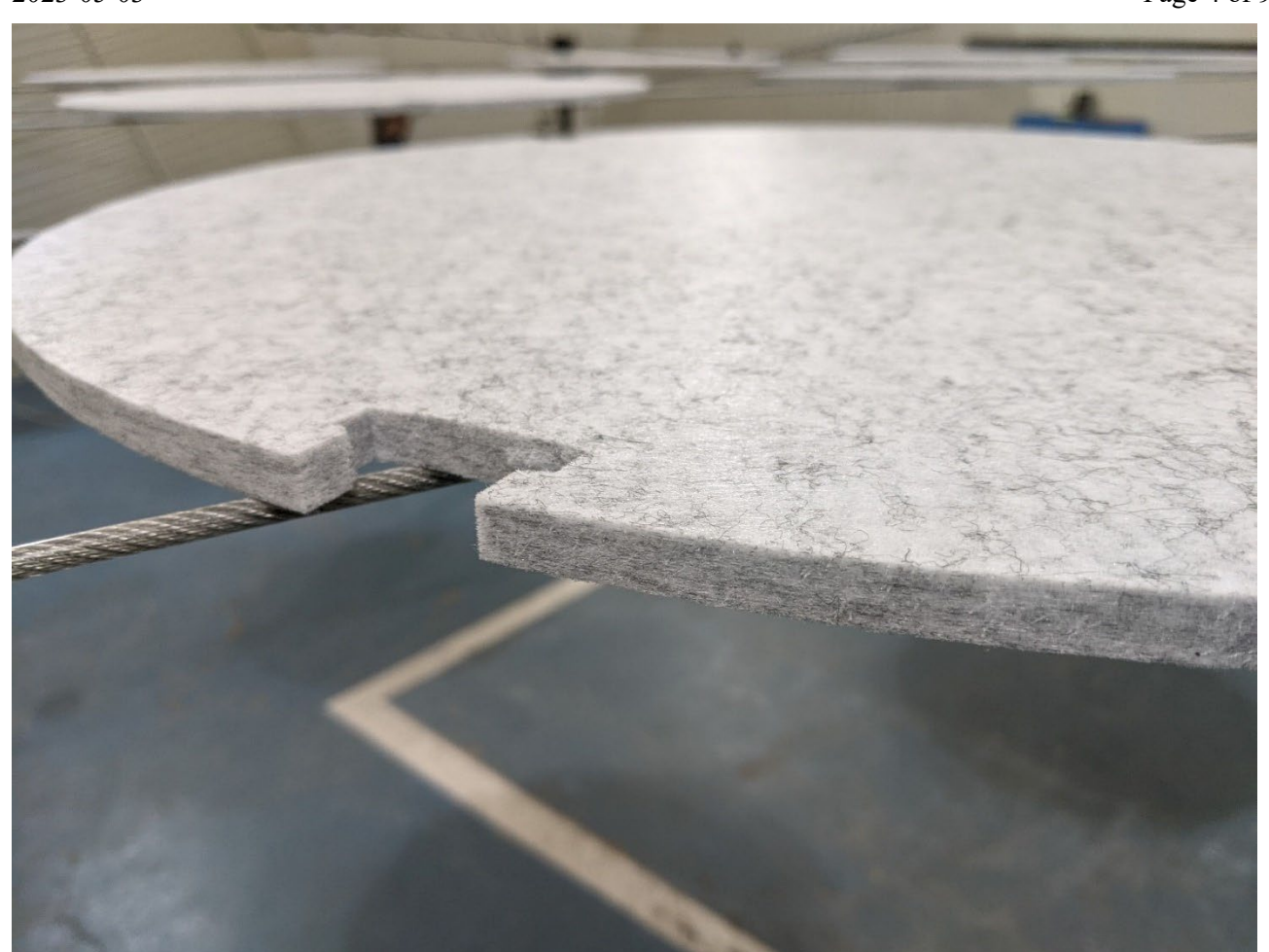
Figure 3 – Detail of specimen material