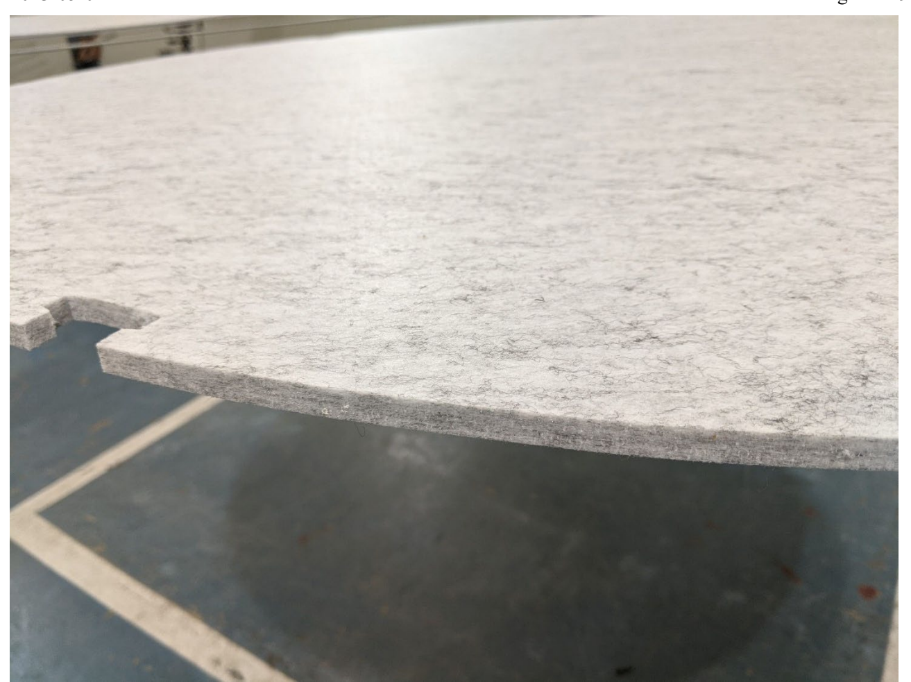
Figure 3 – Detail of specimen material