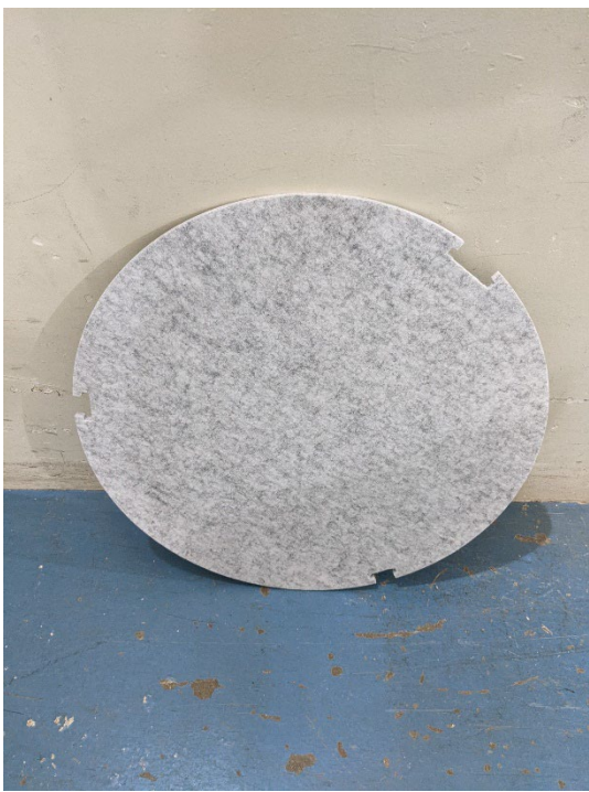
Figure 2 – Individual specimen baffle